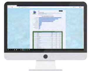
Composition, Market Value & Contamination Reports for You / for Your Supplier