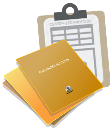
Customized Audit Protocol