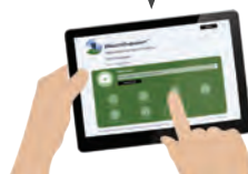
Cloud Based Data Management